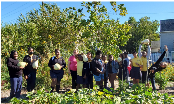
Sisters Academy students visit the Kula Farm without Borders and assist with the harvest.

Kula Farm also facilitates a job program, designed to promote foundational workplace skills for members of the community. By offering a positive work experience to add to a resume, Kula Farm hopes to take away barriers to future employment. Working with your hands, performing tasks like planting and weeding, can also be extremely therapeutic. Those returning to the workforce after a long hiatus or previous incarceration are welcome to restart their journey here--- stop by to fill out an application!