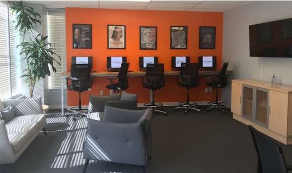
Launch Center Public Computer Lab

meeting areas and private offices for confidential coaching sessions, offers a welcoming and accessible environment from which we can offer our full spectrum of personal, career and business development programs and services to the local community.