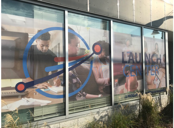
Exterior of the Interfaith Neighbors Launch Center at 1201 Springwood Avenue, Asbury Park, NJ.

On September 13, 2021, Interfaith Neighbors officially opened the Launch Center in the Springwood Center adjacent to MacroBites at the Kula Cafe and the IFN Business Development Center. The Launch Center’s tag line is “Launch your career - Launch your business - Launch your life,” and it represents the evolution of Interfaith Neighbors’ economic and workforce development programming. Moving into the new space also marks the launching of new programs and services that are available to the community, grouping programs and services in a way that allows Interfaith Neighbors to meet people who come to the Launch Center where they are personally in their life.