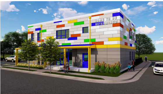
The Early Childhood Learning Center to be located on Atkins Avenue.

The Meeting the Moment Campaign will make it possible for Interfaith Neighbors to add two new Early Childhood Learning Centers to the West Side neighborhood. One, a stand-alone, newly constructed facility will serve the community’s youngest learners, serving children from the ages of three months to three years. The second center will be housed in the Marmora Center, serving children aged three years to five years. Tuition for both Centers will be based on a family’s ability to pay.