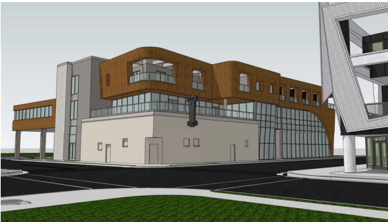
The Marmora Family & Community Center to be located at the corner of Springwood & Atkins Avenues across the street from the existing Springwood Center.

unrest in 1970, the corridor remained a barren landscape for decades until Interfaith Neighbors built the Springwood Center in 2007, bringing the first commercial investment to the corridor in over 35 years. The Marmora Center will continue this investment with the goal of attracting private sector commercial development in the future, while centering our programming within the West Side neighborhood.