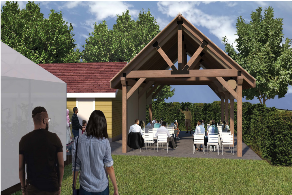
The Kula Farm Expansion will add a three-season pavilion, catering kitchen and restrooms, while continuing to farm the front of the adjacent property in partnership with Bethel AME Church.

living and eating, stress management, and topics such as bee keeping, making healthy foods and beverages from your garden harvests, and more. The Kula Farm continues to provide local employment opportunities and donates over 3,000 pounds of fresh produce to area feeding programs each year.