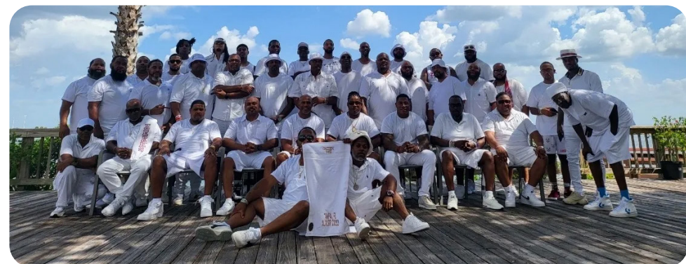
Members of the Cazzeek Brothers, who volunteer their time in the promotion of community service among area youth.